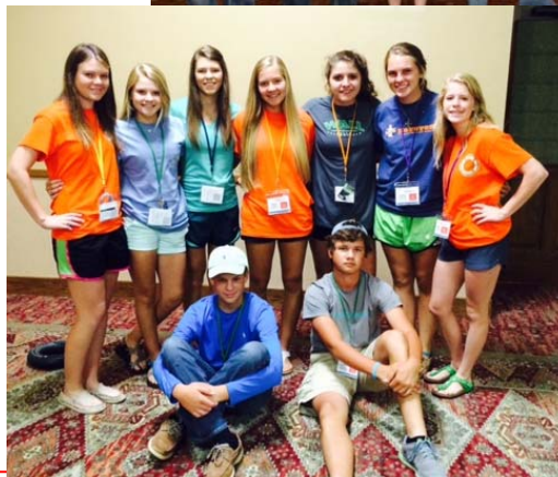
"Staying Afloat on the 4-H Boat" - Theme