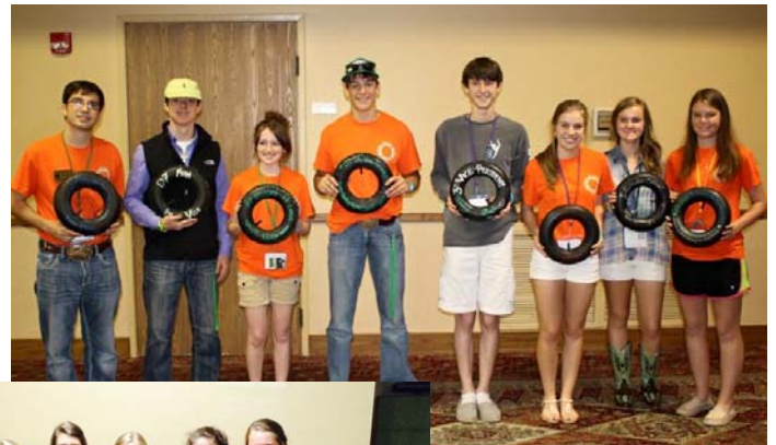
▲ D7 Council Officers