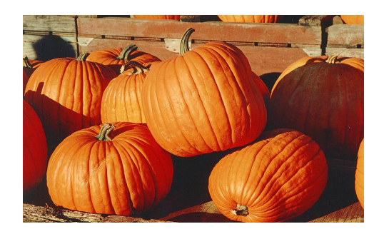
Beta-carotene, found in pumpkins, performs many important functions in our overall health!